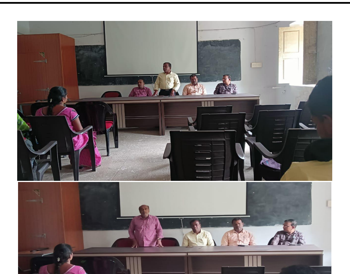
In this Skill Course 66 Degree I year students got orientation Computers and Spoken English.